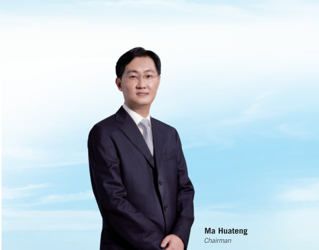
Ma Huateng Chairman

I am pleased to present our annual report for the year ended 31 December 2014 to the shareholders.